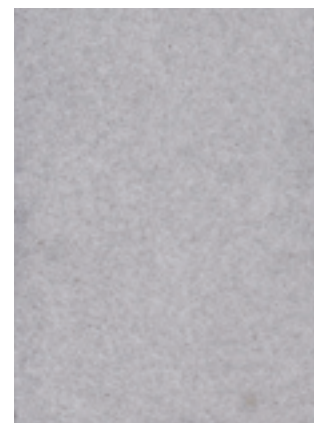
Improved ZINCALUME® steel