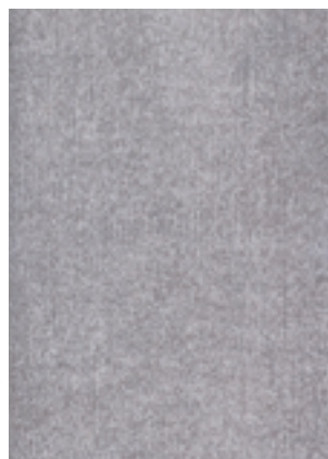
Old ZINCALUME® steel

from solar radiation and minimizes heat transmission into the building cavity – so the superior performance of ZINCALUME® steel means the inside of your building will also be cooler for even longer.